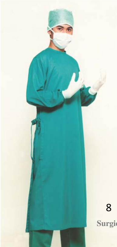
8 Surgical Gowns