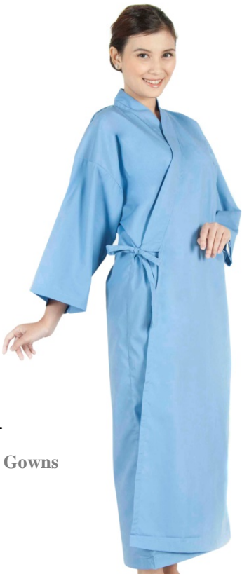
11 Patient Gowns