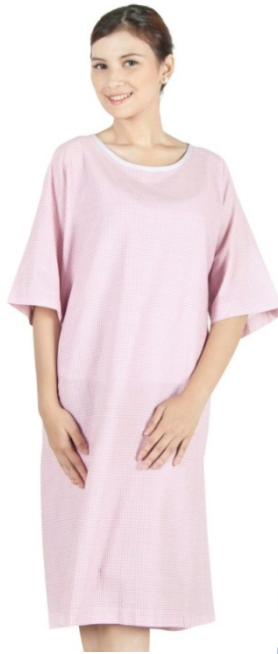
12 Treatment Gowns