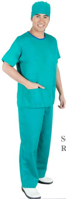
5 Scrub Suits Round neck