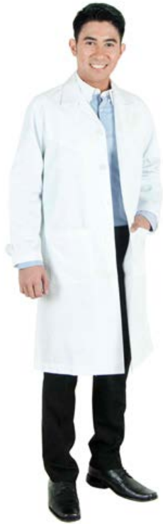
9 10 Lab Coats